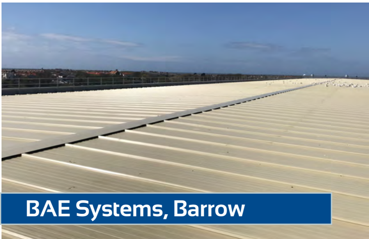
BAE Systems, Barrow

Systems: Hot Melt, Cladding & Rainwater Goods