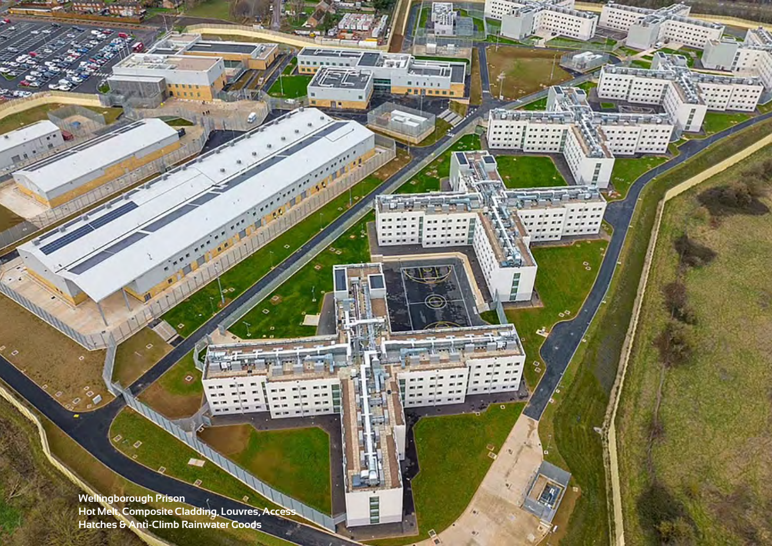
Wellingborough Prison Hot Melt, Composite Cladding, Louvres, Access Hatches & Anti-Climb Rainwater Goods