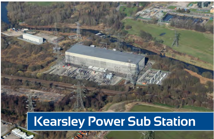
Kearsley Power Sub Station