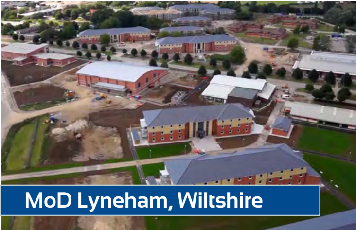
MoD Lyneham, Wiltshire