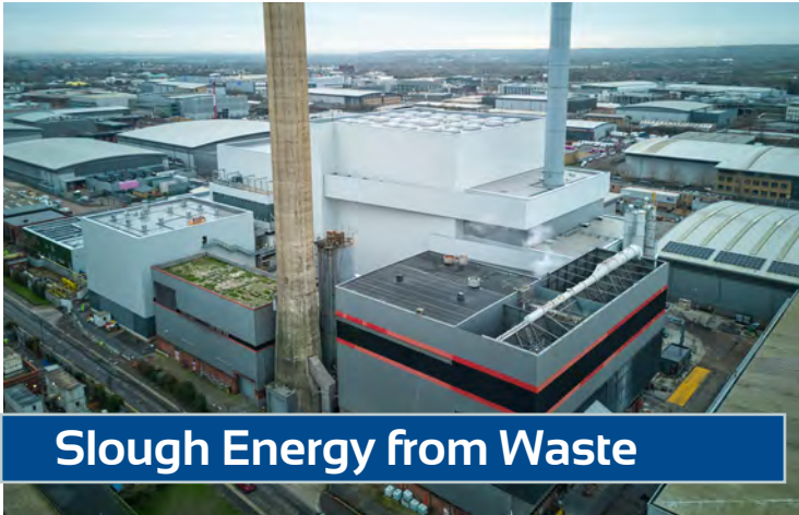
Slough Energy from Waste